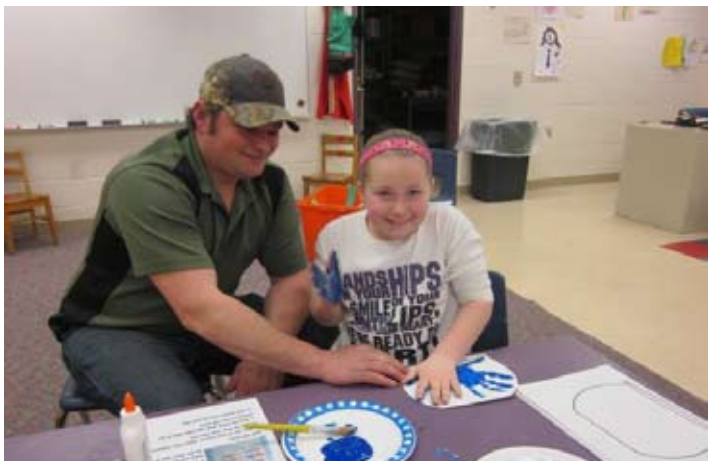
At our Family Outreach program, over 20 families spent time together on the first day of spring creating various crafts. From 'Red Fish, Blue Fish' and shamrocks to rainbows and bunnies, each family left with several craft items to help spruce up their home for spring!