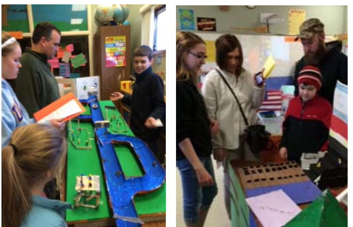
RMS students present their projects at Night of Knowledge, a first for RMS.

May 19 - Regular Board Meeting 7:00 p.m RHS room 167