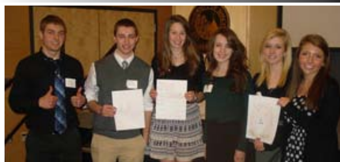
The Junior Achievement's Business Challenge was held on Wednesday, March 26 at UWO-Reeve Union, Oshkosh.

The results reflect the high quality instruction RASD provides for all students in every school. Reading in 10th grade was just below the state average. This is an area of focus for the district. Math scores overall did increase from last year. The specifically designed interventions and enrichment opportunities being provided to support and challenge students in all buildings continue to make a difference.