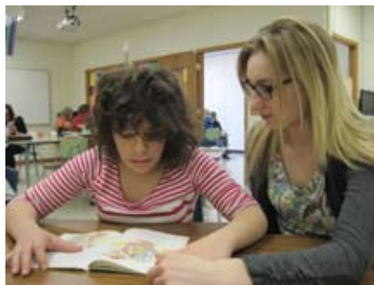
Lumen High School students visit classrooms to share the gift of reading with fellow RASD students.

All the money collected in the scholarship drive is awarded to students. Half of the scholarship money is awarded by lottery drawing to students who participated in the scholarship drive. Contributions may be mailed anytime to the Ripon Education Foundation, PO Box 395, Ripon, WI 54971.