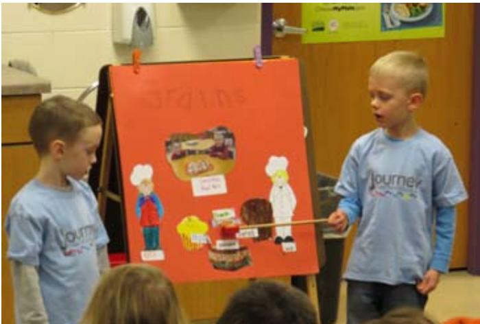
Two students give their presentation to parents and visitors at Journey's Gallery Walk.