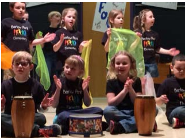
BPES students enjoy performing for parents, family, and friends at the recent Music Demonstration Night.